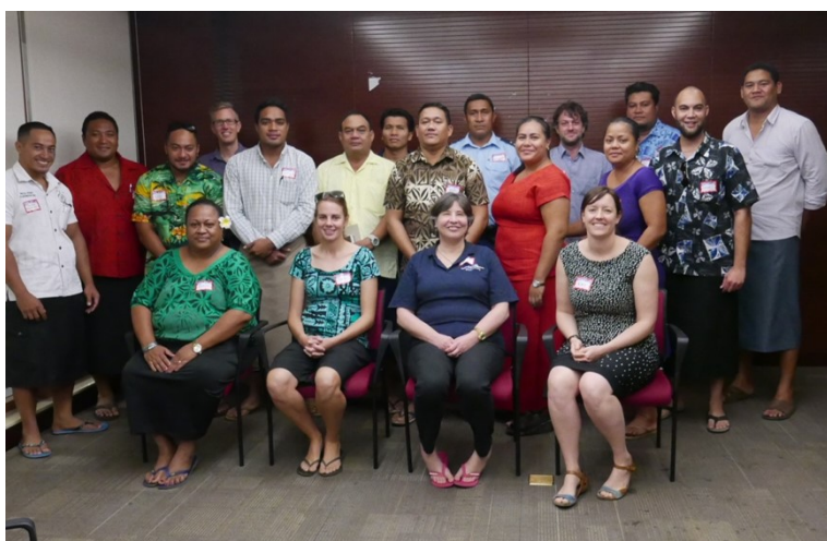
Project Team with Key Stakeholders at the 'PARTneR Design Workshop' in September 12 th – 14 th 2016.

The planned three year pilot is earmarked for implementation from July 2016 – June 2019, with subsequent plans to roll out PARTneR to the broader Pacific.