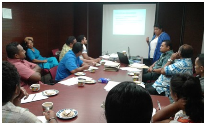
Participants of the training

A training was held for the facilitators of the CDCRM program from the 08 th - 09 th August 2016 as part of the preparations for the pending delivery of the program out into the communities. Participants included members from the FESA, MPoI, SRCS, MWCSD, FLO and DMO (a total of 15 altogether).