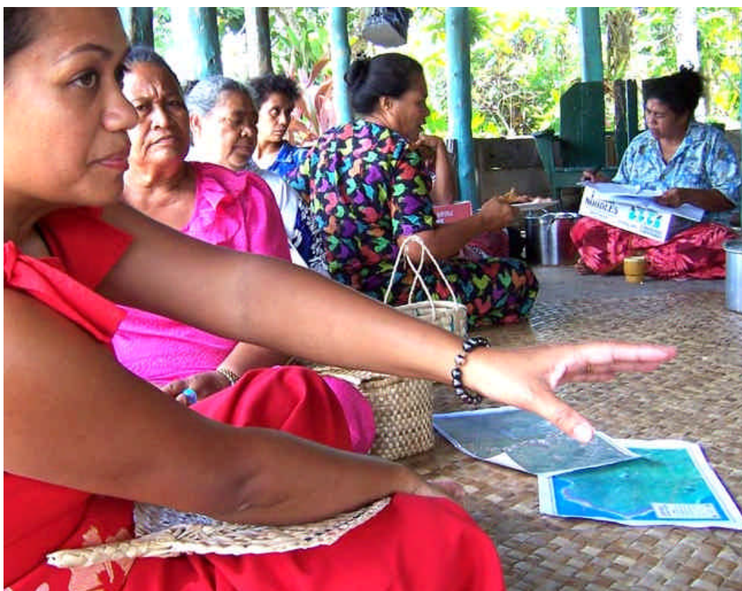
CIM Plan Village Workshop in western Savaii