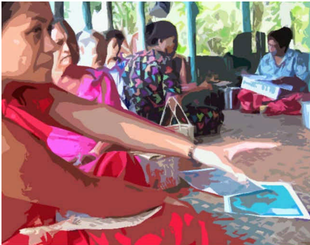
Village meeting in Western Savaii