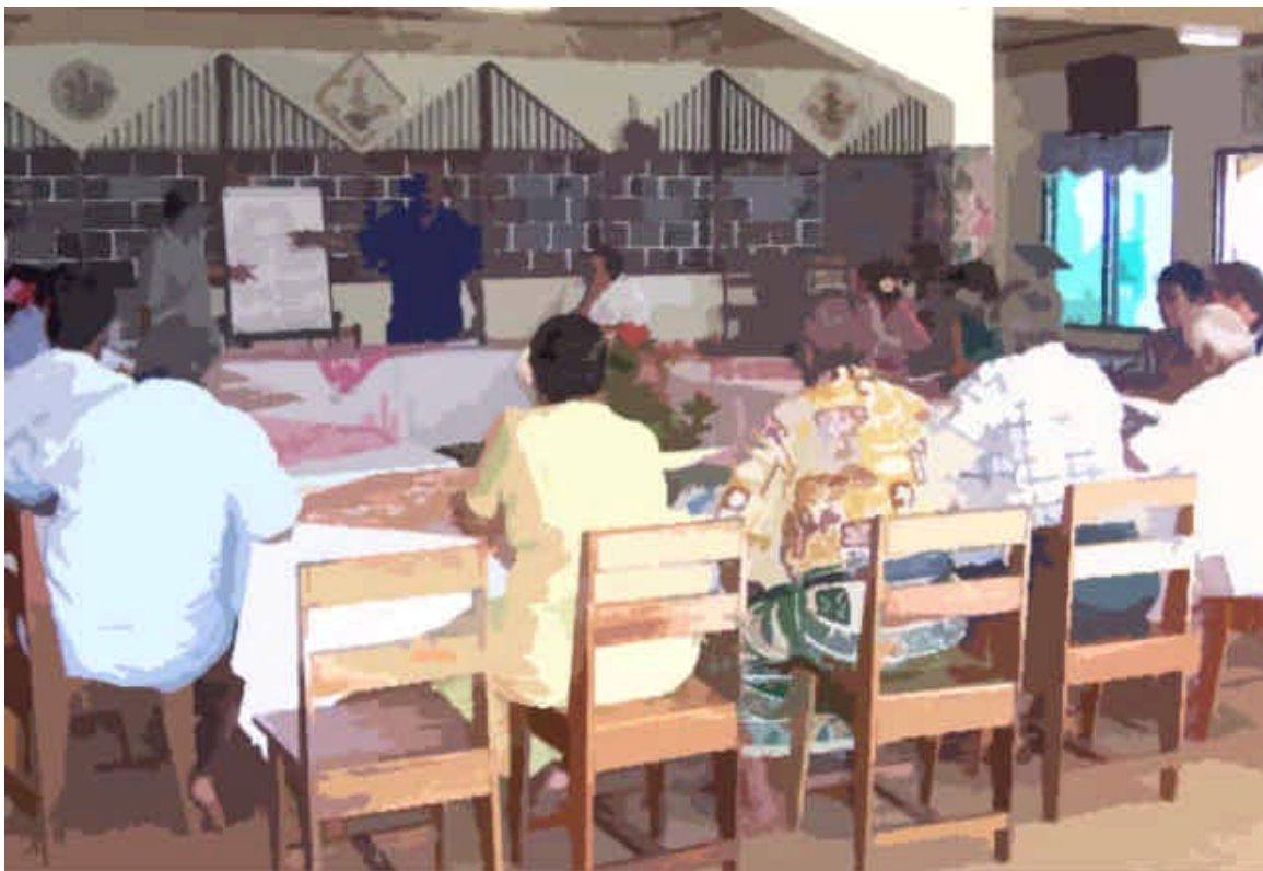
District meeting in Western Savaii