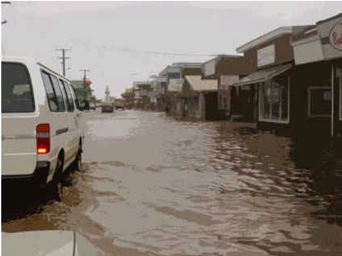
Vaea Street central Apia in flood