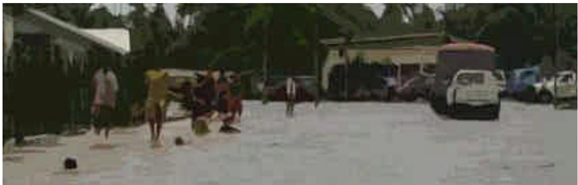
Swimming in the streets of Apia

Most of the elements of this workstream have been completed. The few remaining elements are on schedule.