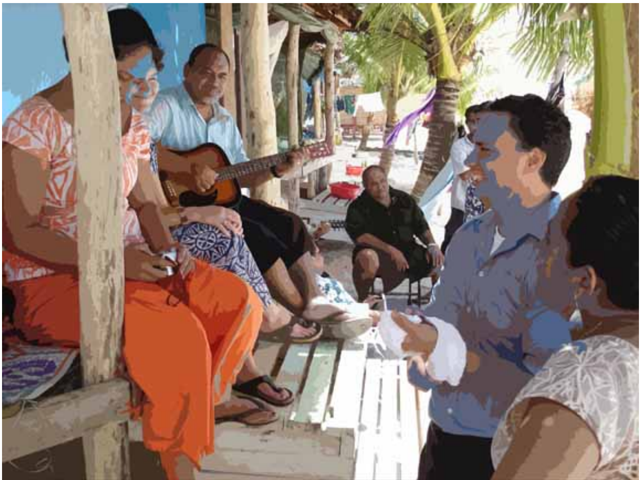
Team members relaxing after 3 intensive weeks of Village and District Workshops