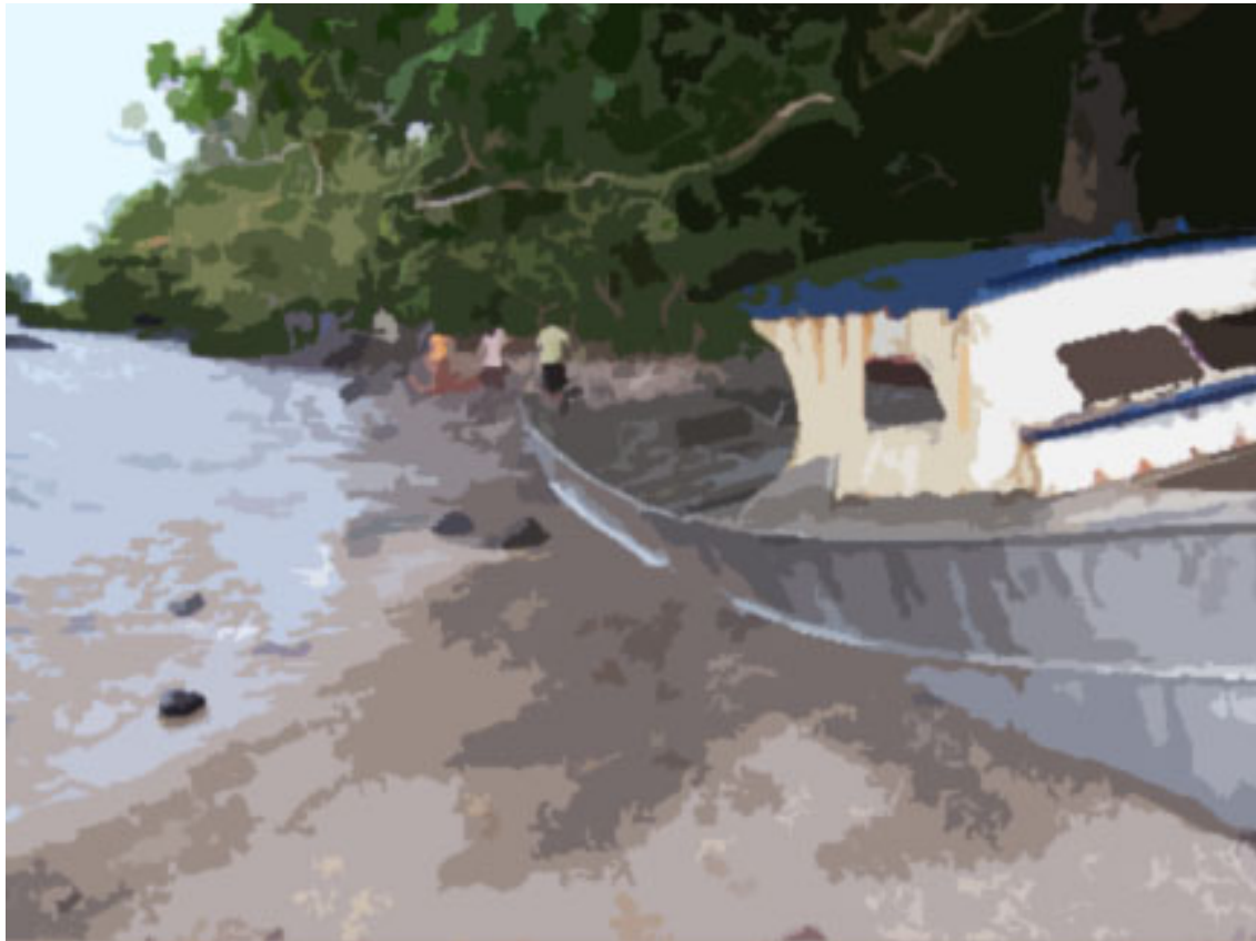
Coastal inspection at A'ufuga