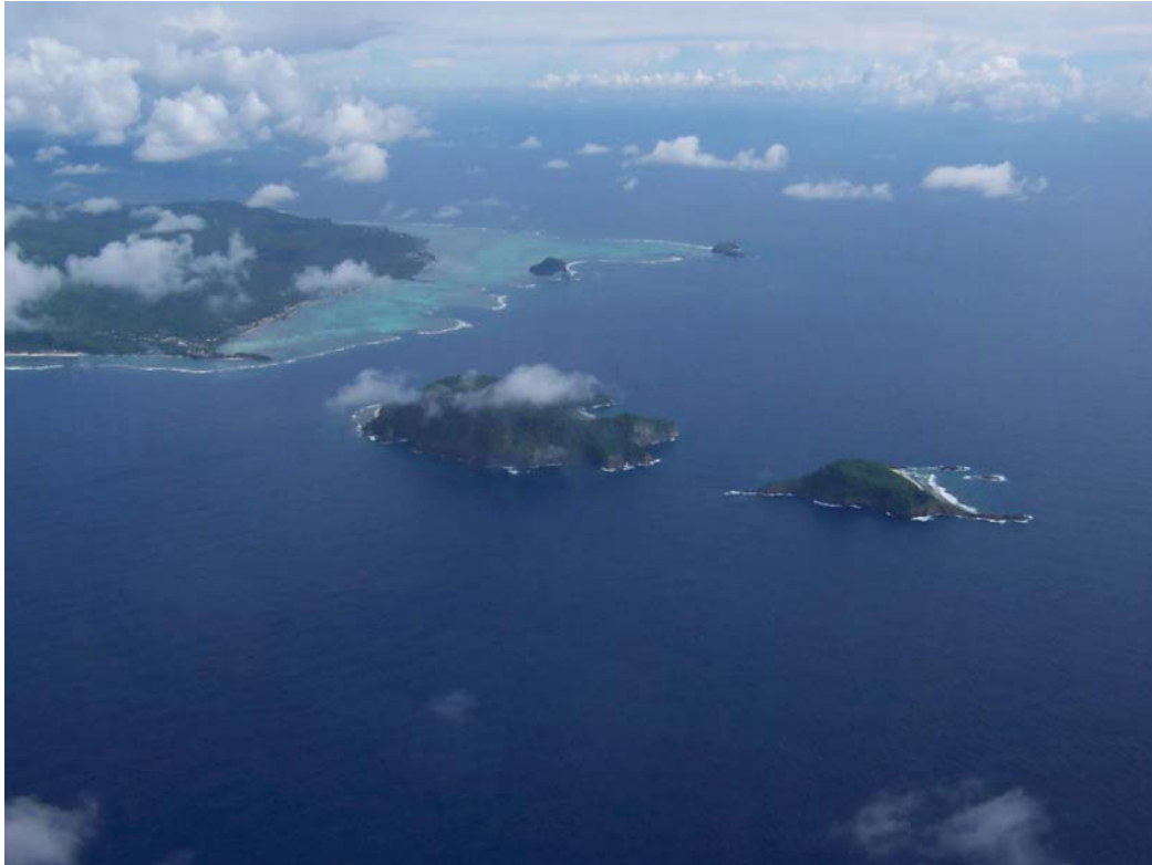
Aleipata District on the east coast of Upolu and its four offshore islands – Nuulua (25ha) is on the right and Nuutele (108ha) is the larger island in the centre of the picture.