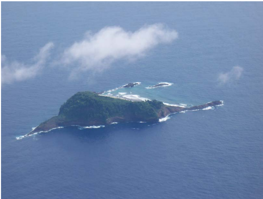
Nuulua Island (25ha)