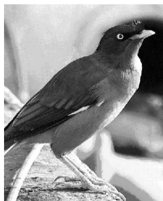
■ JUNGLE MYNA