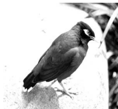
■ COMMON MYNA