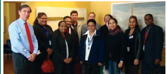
Participants for the 3rd Pacific Regional Work Attachment Programme

The main overall objective for the attachment programme was designed for public servants working in HR areas to have a more direct work experience with representatives from the Australian Public Service Commission; and to share information on key HR Management issues and challenges.