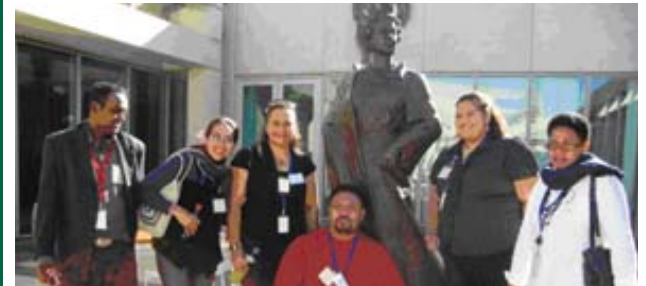
A visit to the Parliament House