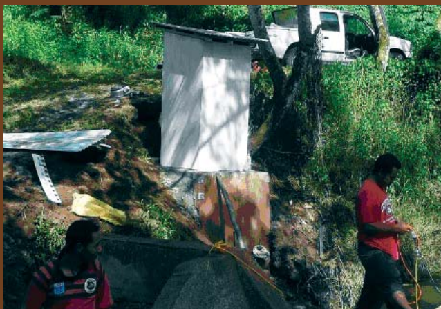
The completed flow gauge housing